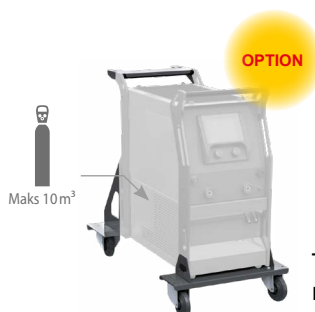
Trolley ref. 040960

Easy mode or PRO mode with access to every parameter.