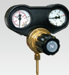
Regulator 30L/min 🇫🇷 041622 🇩🇪 041219 🇬🇧 041646