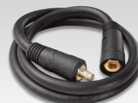
Polarity reversal cable 033689