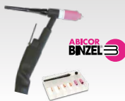
SR17L - 4 m 073739