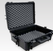
Heavy-duty IP67 work case 060432