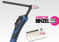
SR17DB - 4 m 069398