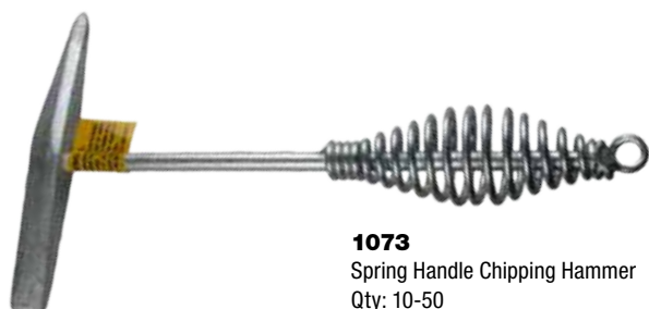
1073 Spring Handle Chipping Hammer Qty: 10-50