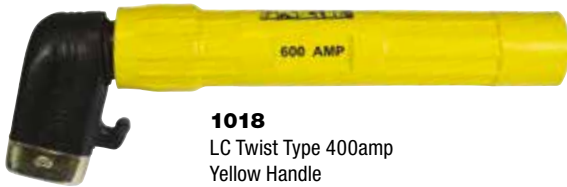
1018 LC Twist Type 400amp Yellow Handle Qty: 10-40