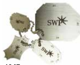
1047 Pocket Welding Gauge Set Qty: 5-50