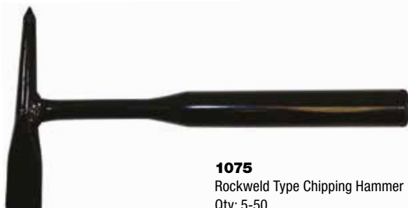
1075 Rockwell Type Chipping Hammer Qty: 5-50