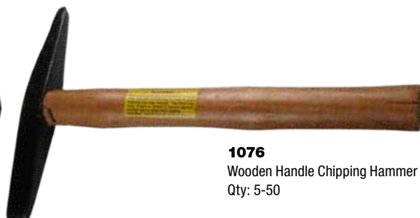
1076 Wooden Handle Chipping Hammer Qty: 5-50