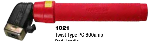
1021 Twist Type PG 600amp Red Handle Econ 406 equivalent Qty: 10-40