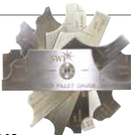
1046 Fillet Type Welding Gauge Set Qty: 5-50