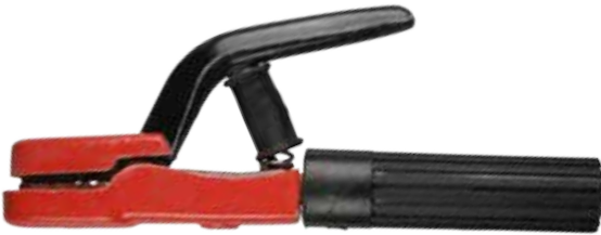
1023 Crocodile Holder 200amp Qty: 1-25