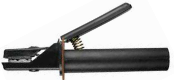
1031 Handicool Type 600amp Qty: 1-30