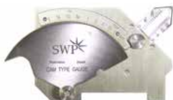
1045 Cam Type Welding Gauge Set Qty: 5-50