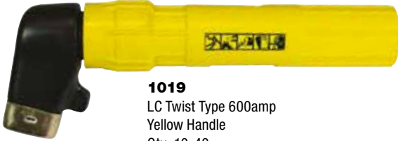
1019 LC Twist Type 600amp Yellow Handle Qty: 10-40