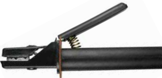
1030 Handicool Type 400amp Qty: 1-30