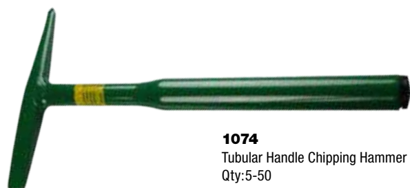
1074 Tubular Handle Chipping Hammer Qty: 5-50