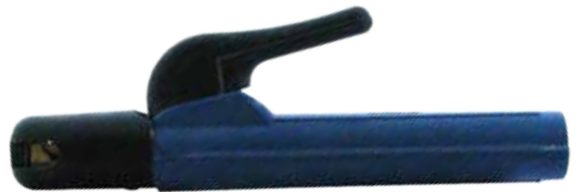
1026 Optimum 450amp Qty: 1-25